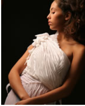
“Seashells by the Seashore IV”